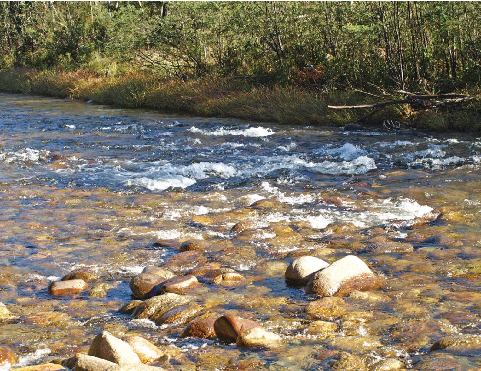
Swamy Plains River, near Geehi, Kosciuszko National Park.